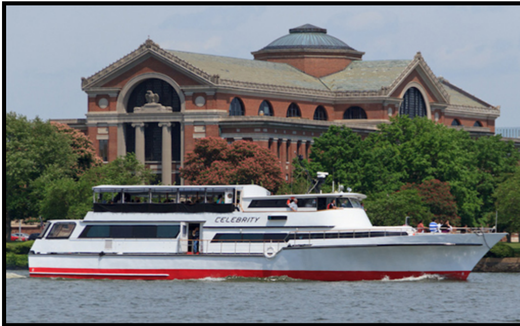
Photo of Celebrity , the second largest yacht in the Capitol Yacht Charters fleet.